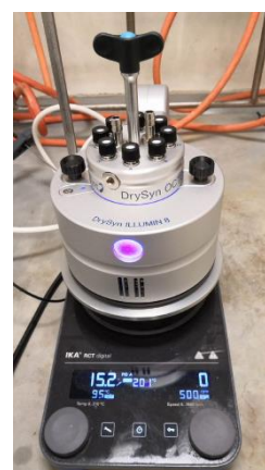
Figure 1. Asynt's Illumin8 set-up

Our studies, using similar conditions to those developed by MacMillan et al. , were carried out on Boc- N -pyrrolidine with a range of aryl bromides of interest to LCC (Scheme 1). This methodology gave access to 2-substituted pyrrolidines with poor to good yields. The reaction was amenable to electron-withdrawing groups (ester, nitrile, aldehyde, trifluoromethyl), halides (bromide, fluoride) and boronic esters. Substitution in the ortho-position was generally less tolerated than substitution in the para- and meta-positions.