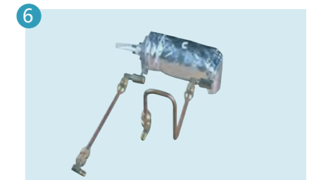
Metal Pipe, high temp-tolerated, more reliable and durable.