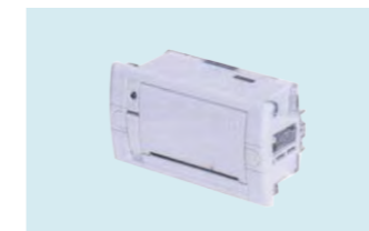
Built-in micro printer