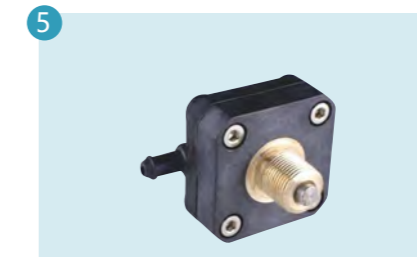
Innovative pressure device, double safety protection