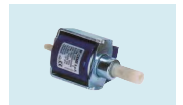
ULKA pumps, low noise