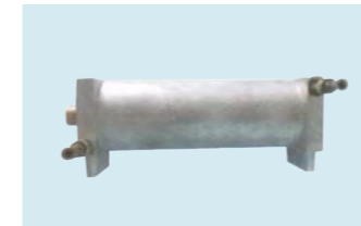
Spiral steam generator