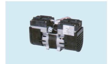
Inlet vacuum pump