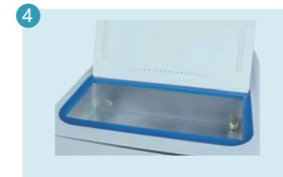
Wide-open water tank on top, easy to maintain and clean.