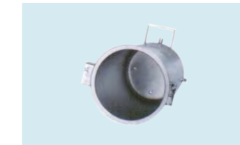
The chamber is perforated by stainless steel (#304, thickness :2.5mm).