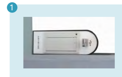
Built-in printer and USB port